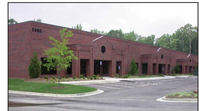
Multi-Unit Building, Site #14 6,400 - 64,000 SF 5340 McEver Road