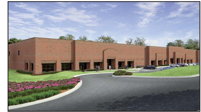
Multi-Unit Spec Building, Site #8 10,118 - 94,461 SF 5445 Rafe Banks Drive