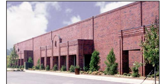
Multi-Unit Building, Site #9 9,914 - 81,040 SF 5405 Rafe Banks Drive