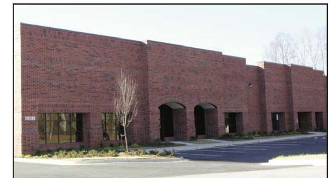
Multi-Unit Building, Site #15 8,372 - 41,860 SF 5362 McEver Road